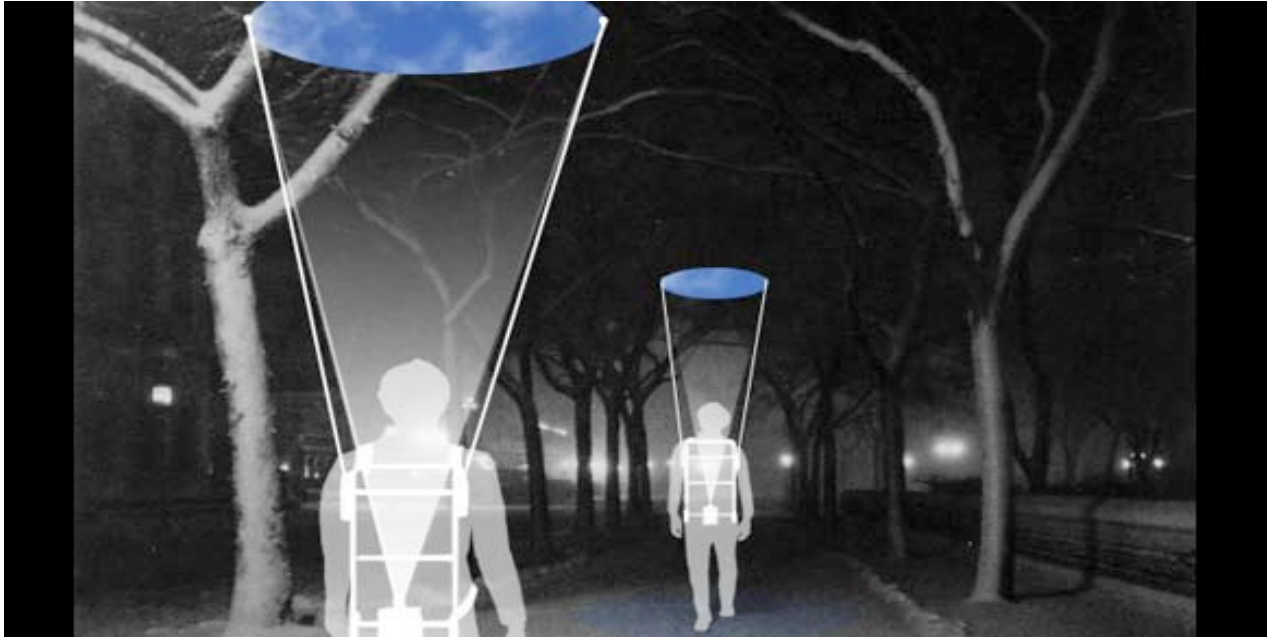
Peter Russell, Skylight , interactive visual-performance