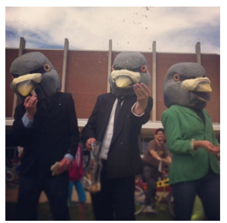
Know No Stranger, Pigeons of Indy, 2014